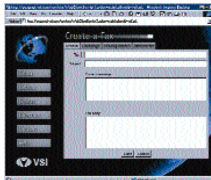
VSI Web Fax Client